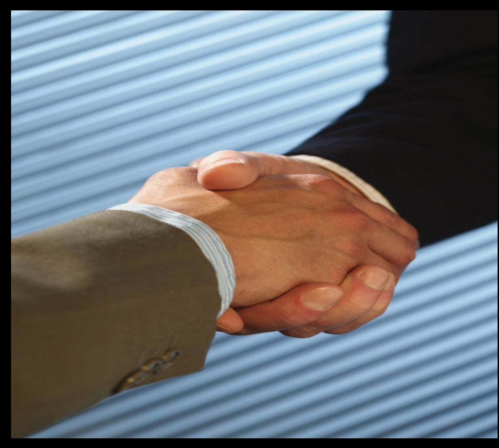
Planning, Policy and Interpretations Subcommittee